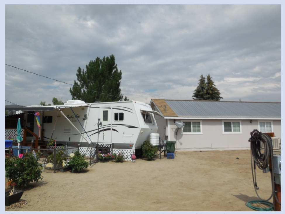
Washoe County Board of Adjustment October 5, 2017